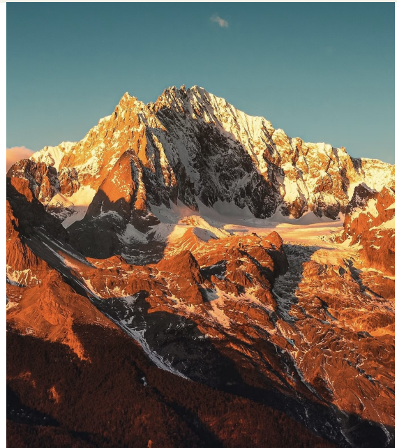
Soft landscape tones support the cultural transition toward Mosuo village life.