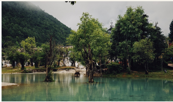
Turquoise waters and forested scenery introduce Yunnan's layered natural beauty.

The itinerary balances ancient towns, ethnic traditions, snow-capped mountains, alpine lakes, wetlands, markets, and memorable travel photography opportunities.