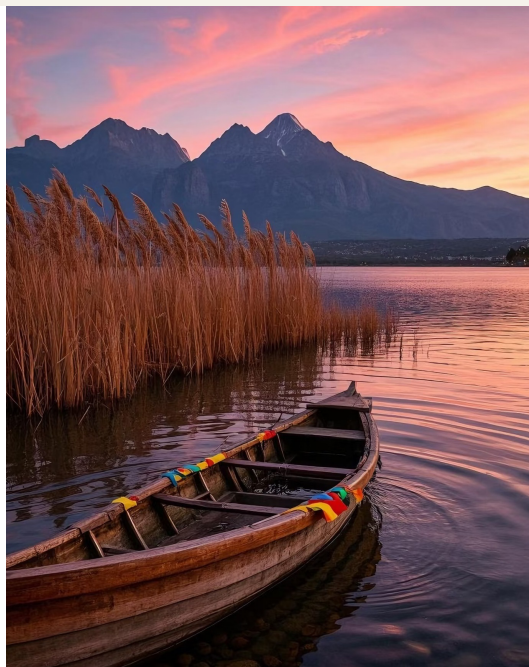
A final scenic photograph reinforces the route's elegant, slow-travel rhythm.