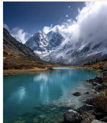
A carefully selected photograph adds depth to the Dali cultural section.