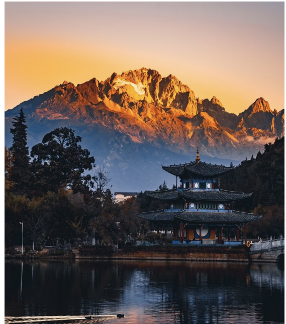
A detailed scenic frame adds atmosphere to the snow-mountain day.