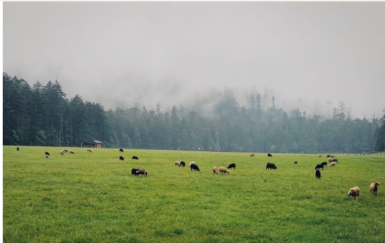
Open landscapes and pastoral details enrich the transfer from Dali to Lijiang.

Breakfast, lunch, and dinner are included.