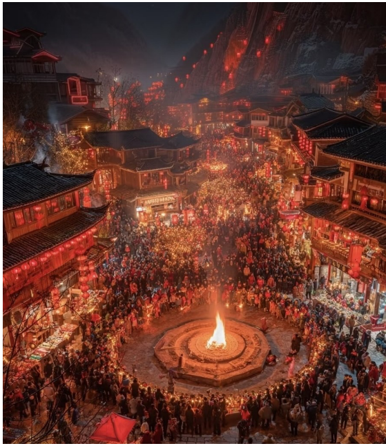
Local color and Yunnan scenery create a gentle opening to the journey.