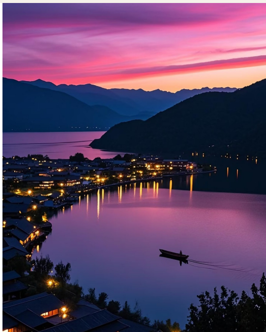
A warm travel image provides a sense of boutique comfort and evening atmosphere.