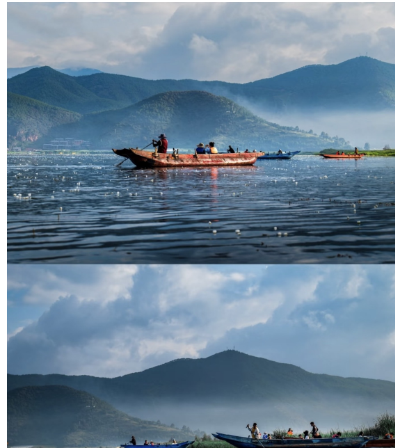
A refined travel photograph that adds atmosphere and texture to the itinerary.