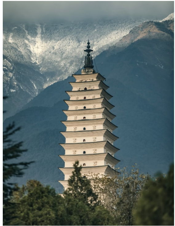
A tranquil travel scene that complements Kunming and Dali's slower pace.