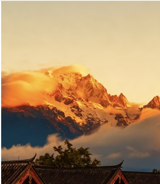
A selected high-resolution photograph evokes the remote atmosphere of Lugu Lake