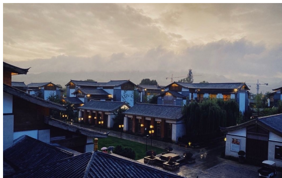
A curated stay and lifestyle image adds a hospitality note to the itinerary.

Contact - China Voyagers | Email: info@chinavoyagers.com & info@cigtours.com | Tel: +1 8126062863 | WhatsApp: +1 9424447737 | Website: https://www.chinavoyagers.com