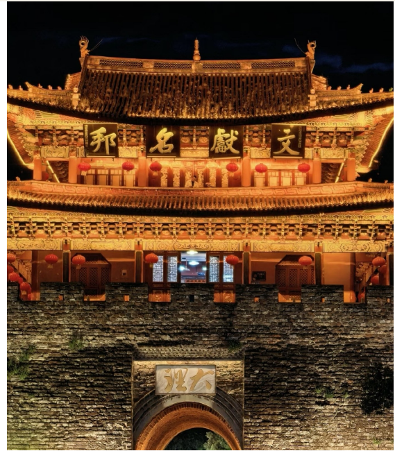
A vertical scenic photograph supports the old-town and highland narrative.