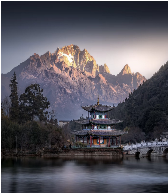
Jade Dragon Snow Mountain and its surrounding highland scenery form a dramatic Lijiang highlight.