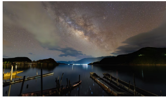
A wide highland view brings a cinematic sense of place to the Yunnan journey.